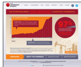
The Consensus Project Website