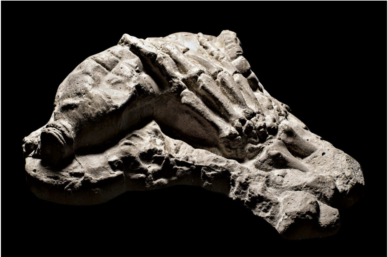
In the sugarcane region of El Salvador, as much as one-fifth of the population has chronic kidney disease, the presumed result of dehydration from working the fields they were able to comfortably harvest as recently as two decades ago.

Humans, like all mammals, are heat engines; surviving means having to continually cool off, like panting dogs. For that, the temperature needs to be low enough for the air to act as a kind of refrigerant, drawing heat off the skin so the engine can keep pumping. At seven degrees of warming, that would become impossible for large portions of the planet's equatorial band, and especially the tropics, where humidity adds to the problem; in the jungles of Costa Rica, for instance, where humidity routinely tops 90 percent, simply moving around outside when it's over 105 degrees Fahrenheit would be lethal. And the effect would be fast: Within a few hours, a human body would be cooked to death from both inside and out.