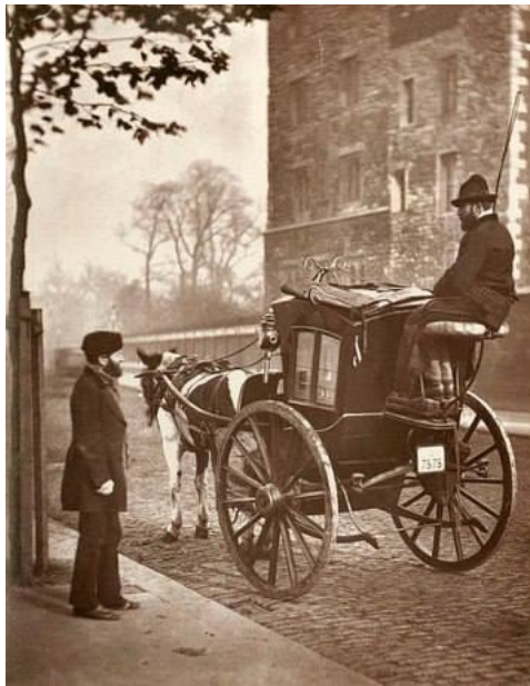
London Hansom Cab

Each horse also produced around 2 pints of urine per day and to make things worse, the average life expectancy for a working horse was only around 3 years. Horse carcasses therefore also had to be removed from the streets. The bodies were often left to putrefy so the corpses could be more easily sawn into pieces for removal.